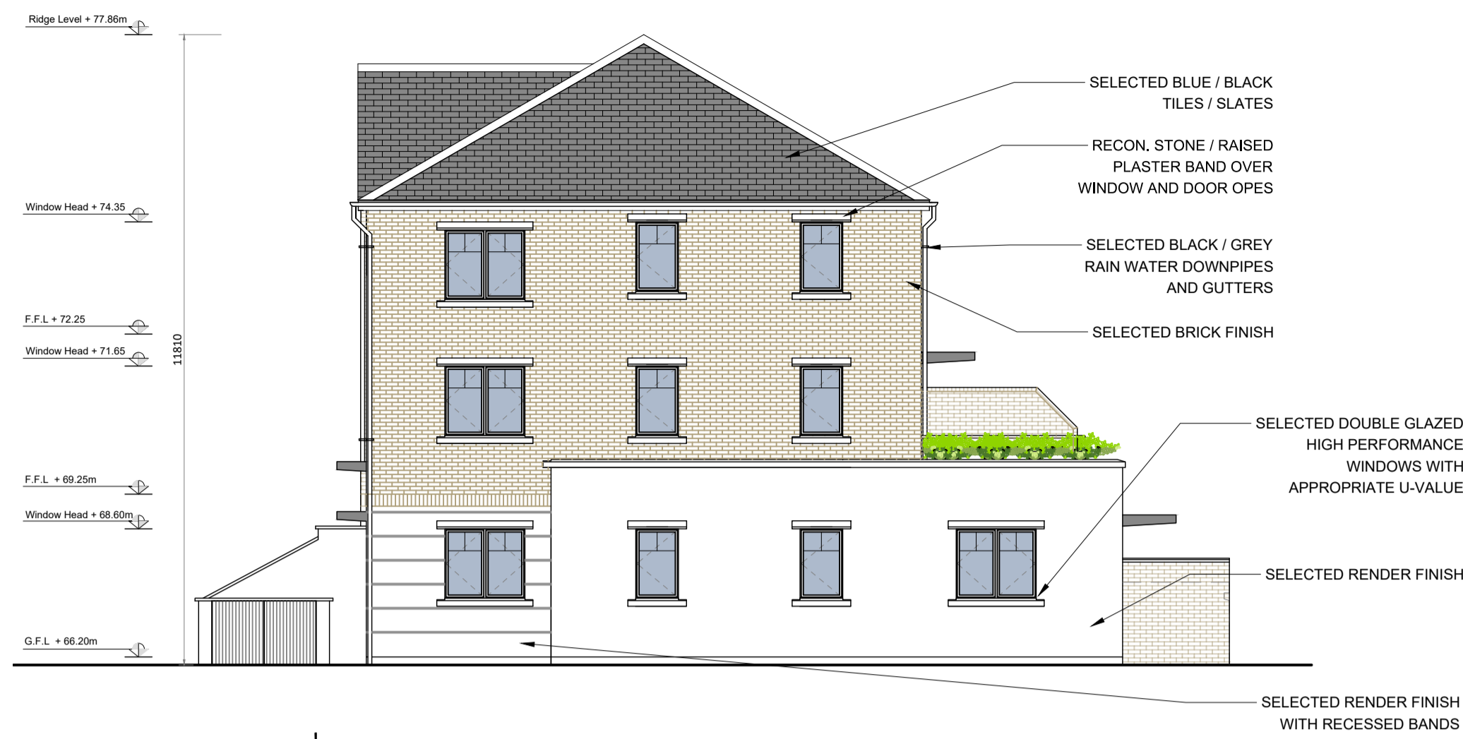
NORTH EAST ELEVATION - BLOCK B