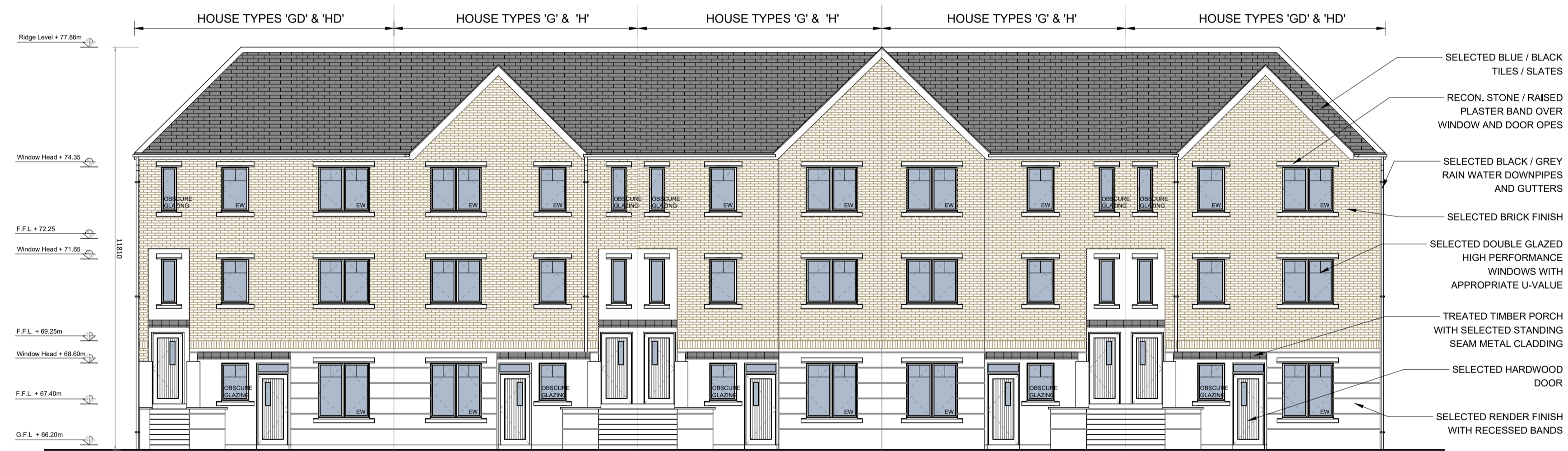
SOUTH EAST ELEVATION - BLOCK B