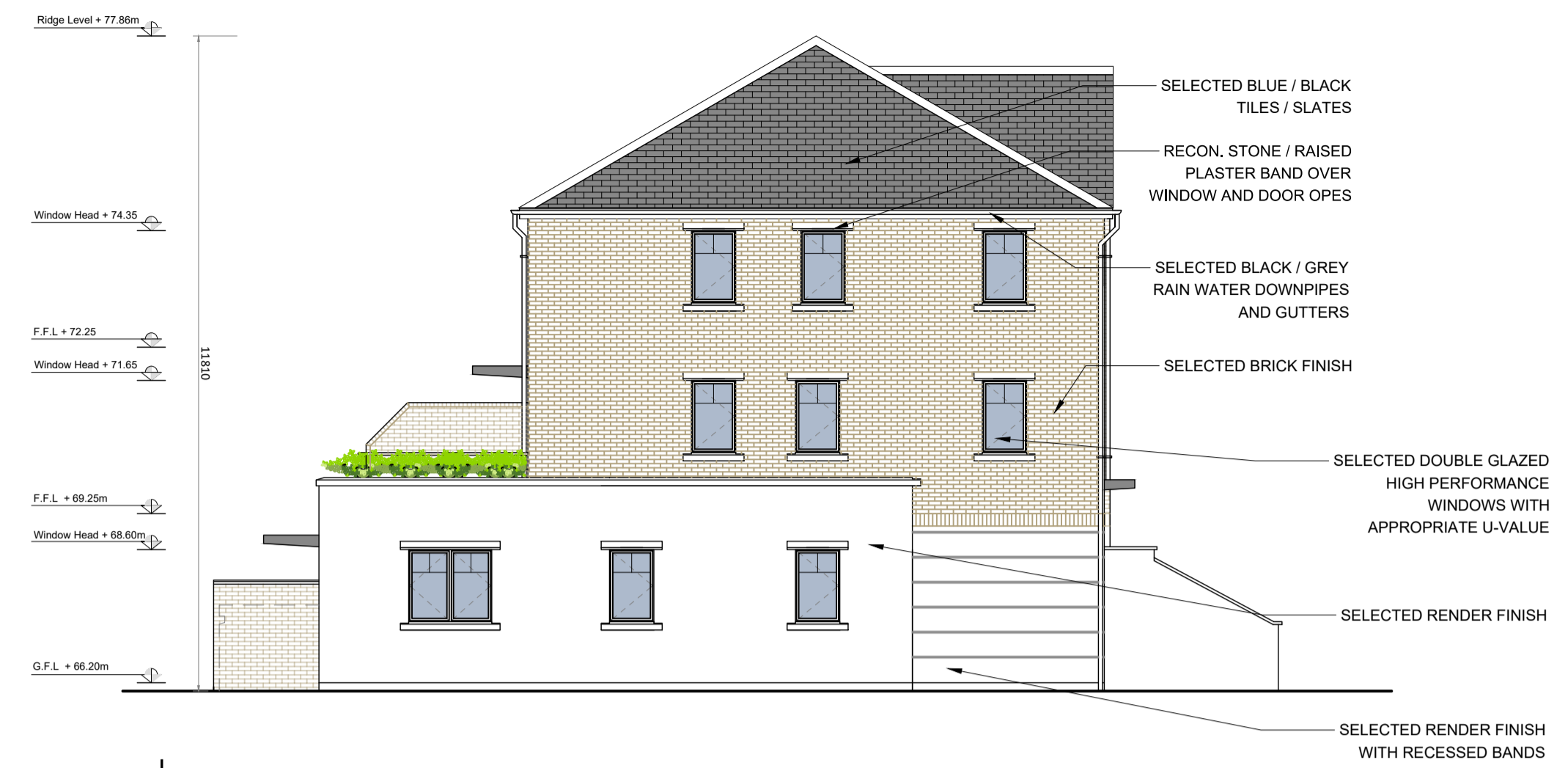
SOUTH WEST ELEVATION - BLOCK B